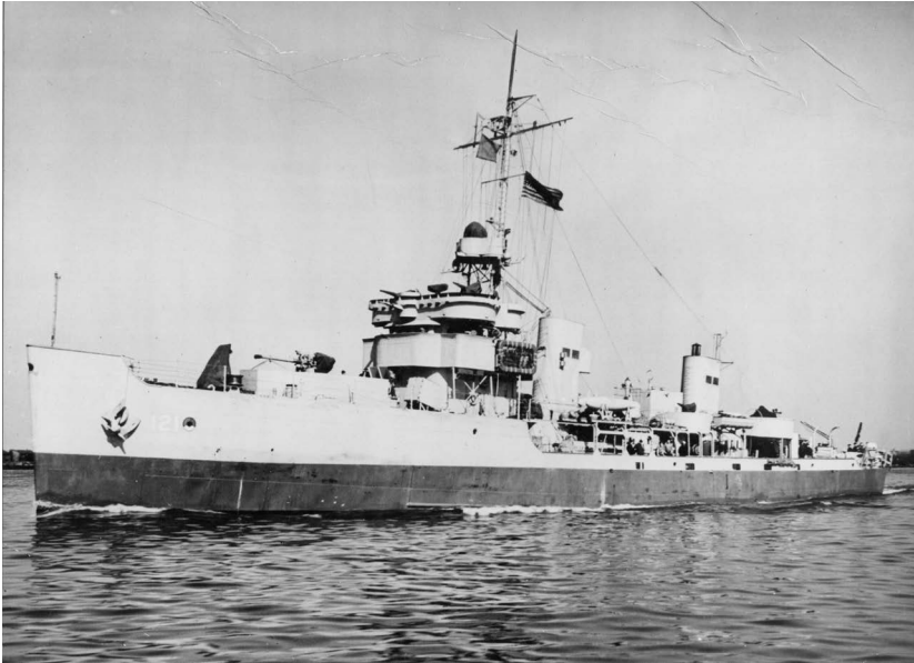
USS Swerve